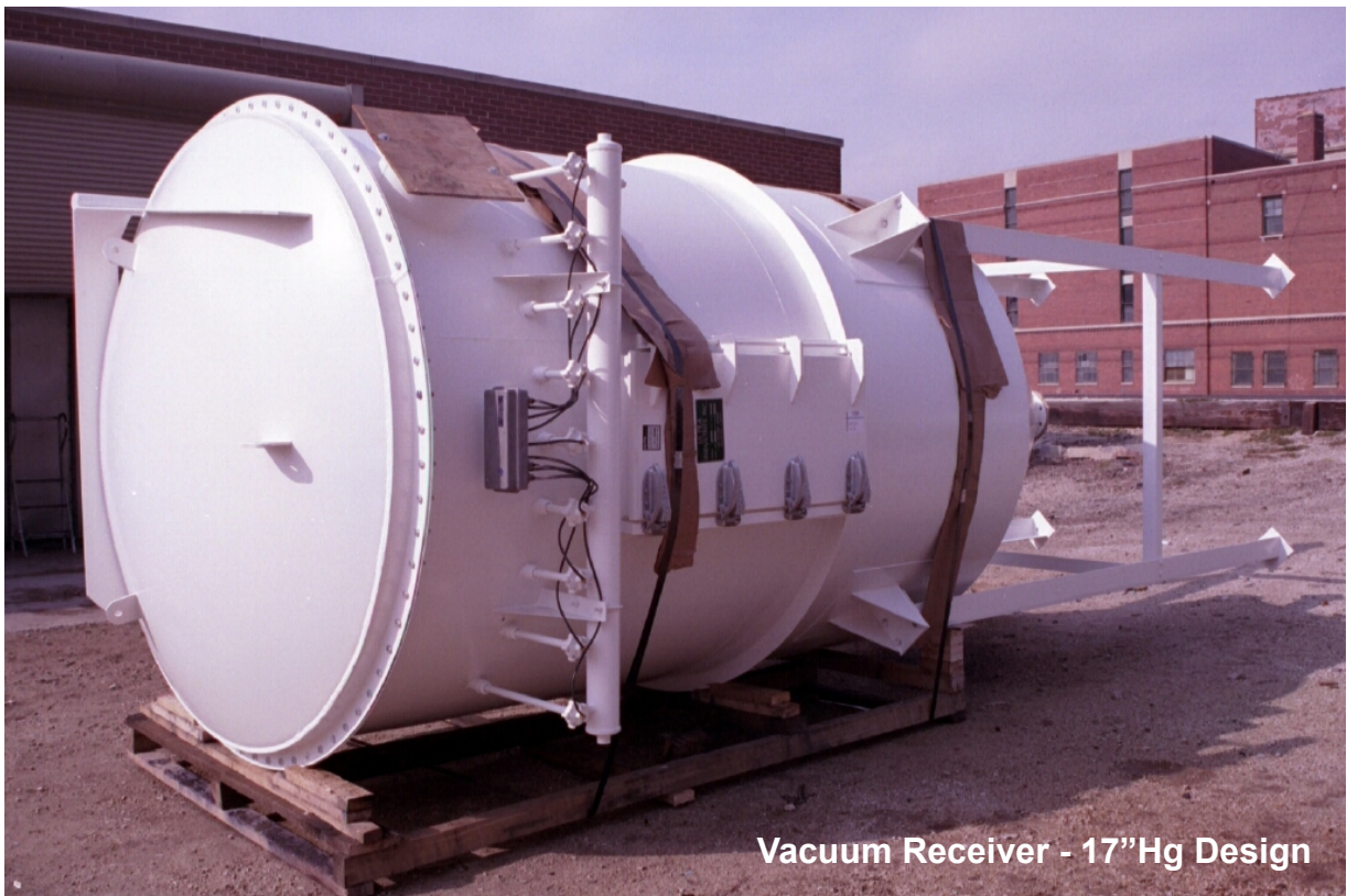
Vacuum Receiver - 17" Hg Design