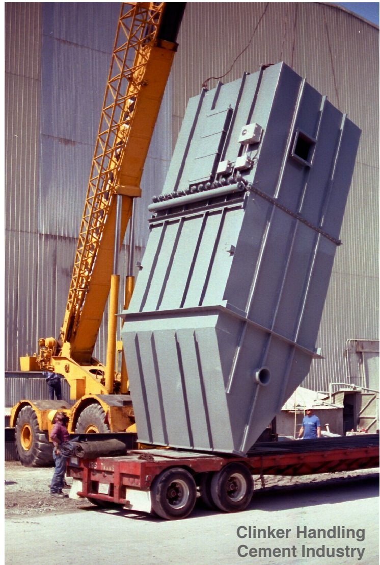
Clinker Handling Cement Industry

Abbott Laboratories BASF Blue Circle Cement Co. Cargill, Inc. Crossfield Catalyst Co. CEMEX-USA Decatur Foundry Co. Diamond-K Industries Dixon Ticonderoga Co. Doumak, Inc. Eastman Kodak Co. Ferenco Corporation Formica Corporation Gilbert Paper Co. Johnson Controls, Inc. Koppers Industries, Inc. Lafarge North America Linwood Mining & Minerals Michiana Trailer Co. Midwest Grain Products Mississippi Lime Co. Nanophase Technologies National Cement Co. Oregon Iron Works Nelson Trailers Powdertech Corporation Prairie Du Rocher Lime Co. Rowe Foundry, Inc. St. Lawrence Cement Co. St. Marys Cement Co. Stellite Coatings TEMEX Thermafiber, LLC Unilever United States Gypsum Co. Western Lime Corporation