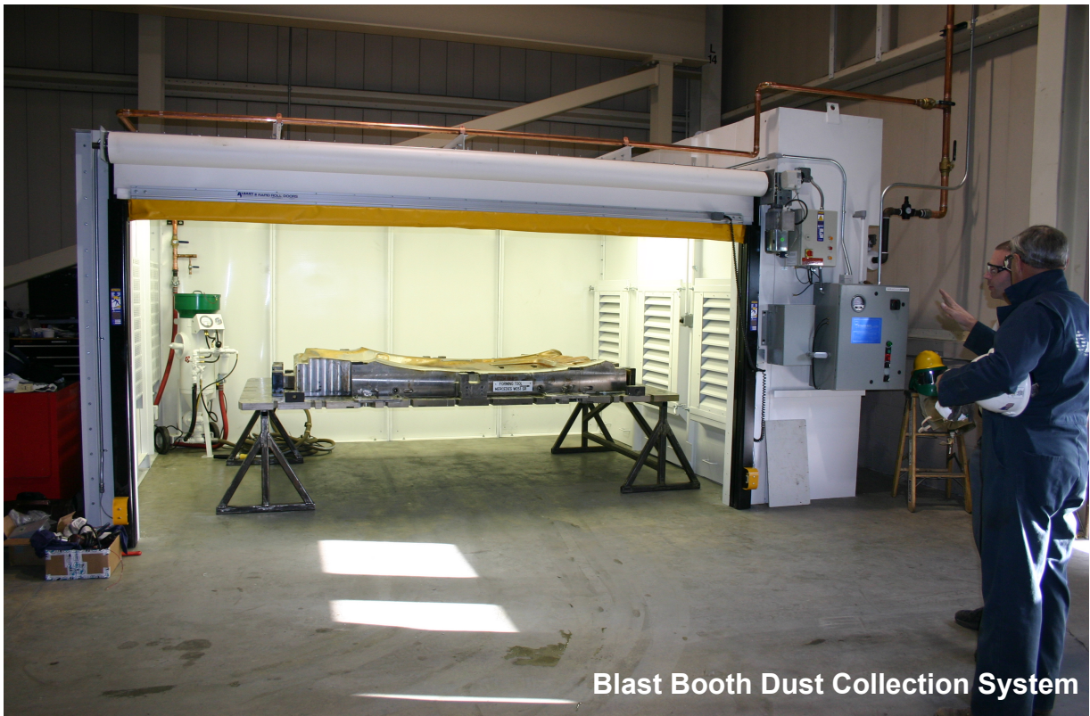
Blast Booth Dust Collection System