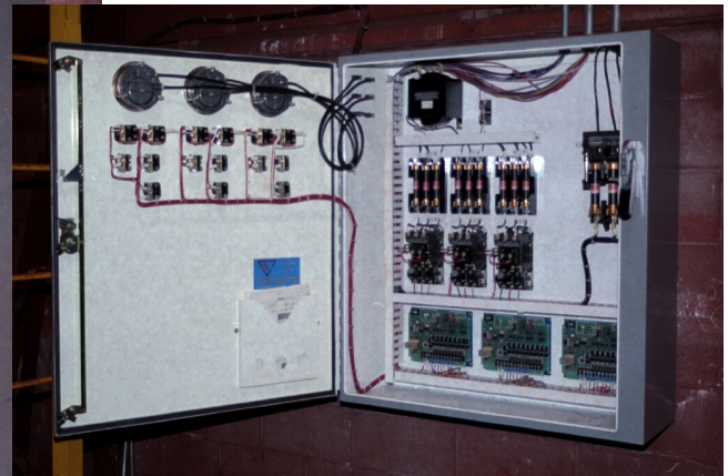
Custom Designed Electrical Control Panels & Instrumentation